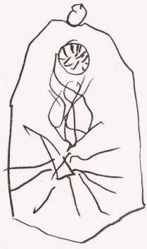
Alchemistischer Typus (Beuys)