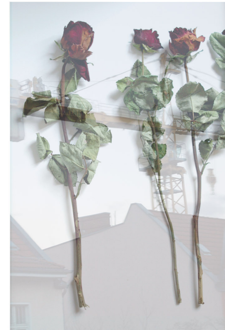
The World as a Garden